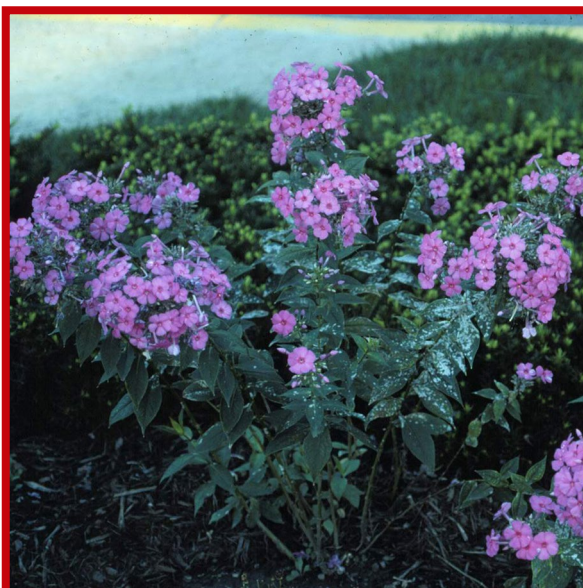
Perennial plants such as phlox and beebalm can be very susceptible to powdery mildew.

What is powdery mildew? Powdery mildews are diseases that occur on the above-ground parts (especially the leaves) of many herbaceous ornamentals, as well as deciduous trees and shrubs, indoor houseplants, and many agricultural crops. Conifers are not affected by these diseases.