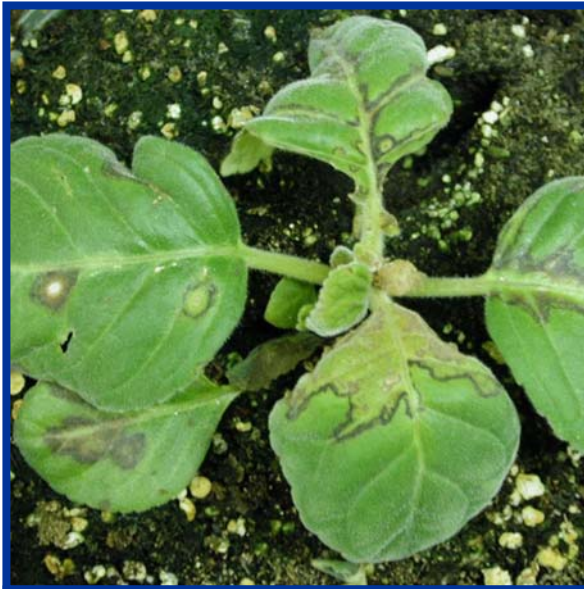
Symptoms of impatiens necrotic spot on Gloxinia.

How do I control impatiens necrotic spot in the future? Impatiens necrotic spot control measures concentrate on excluding INSV and preventing its spread. Inspect any plants entering a greenhouse (e.g., new plant shipments, plants moved in from outdoors) for viral symptoms and thrips. Isolate new plants